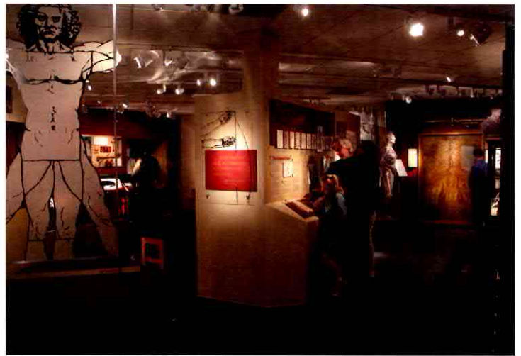
Museum Gallery 2014

Meeting the needs of the ever expanding collection, the Museum acquired half of an old office space from the Gutensohn Clinic basement. This additional 3,000-square-foot space featured characteristics favorable to museum collection storage use: limited access (good for security), open plan (desired for adaptable collection storage), a better fire