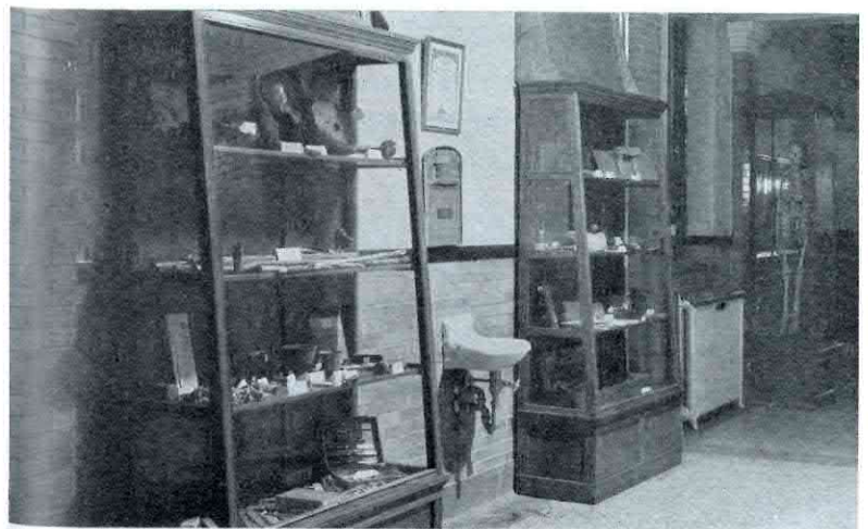
THE OLD DOCTOR'S MUSEUM

The two cases that held the first items from the Museum.