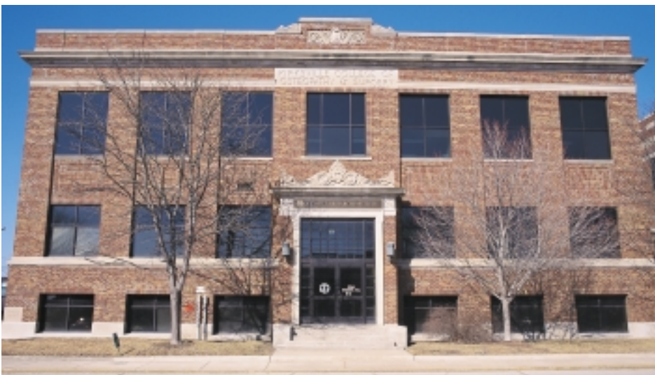
The A. T. Still Research Institute supports two research centers in Kirksville.

This is the first such collaborative funding effort in the osteopathic profession. The primary hypothesis of this study states that osteopathic manipulative treatment, in